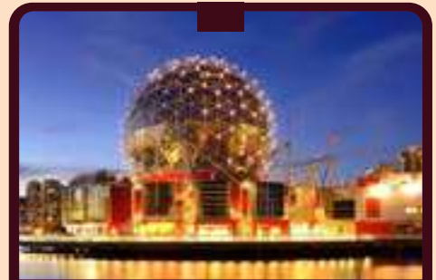
Science World at TELUS World of Science