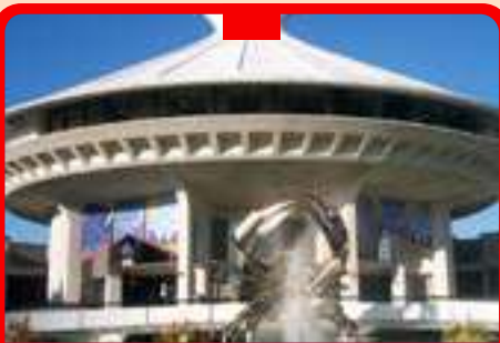
Museum of Vancouver