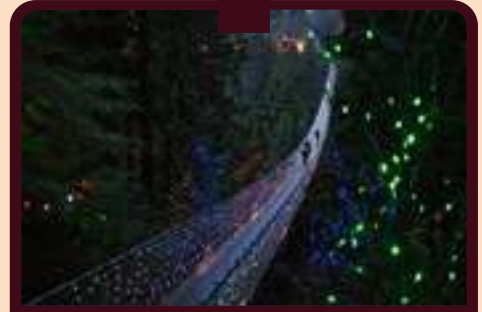
Capilano Suspension Bridge