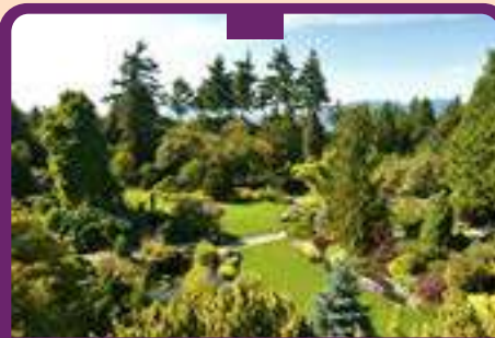
Queen Elizabeth Park