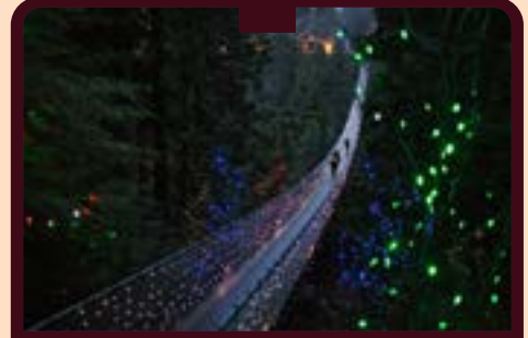
Capilano Suspension Bridge