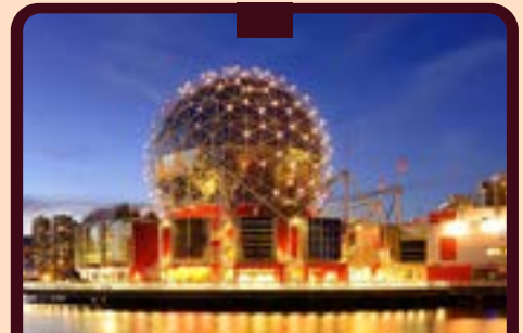
Science World at TELUS World of Science