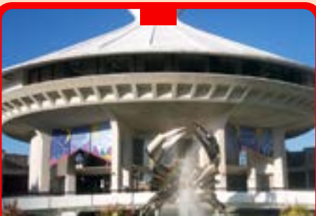
Museum of Vancouver