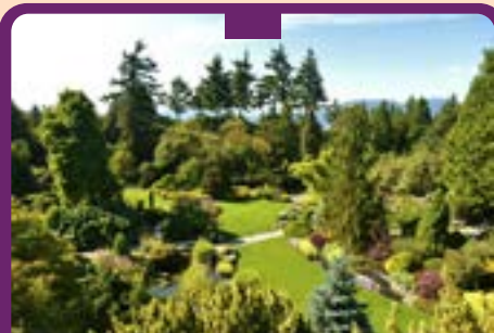
Queen Elizabeth Park