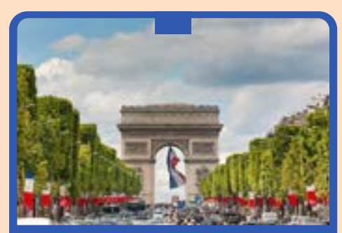
Arc de Triomphe