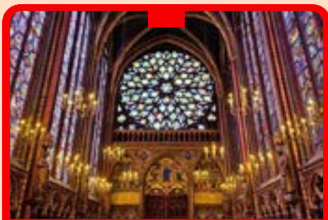
Musical Concerts at Sainte Chapelle