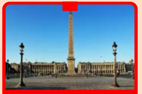
Place de la Concorde