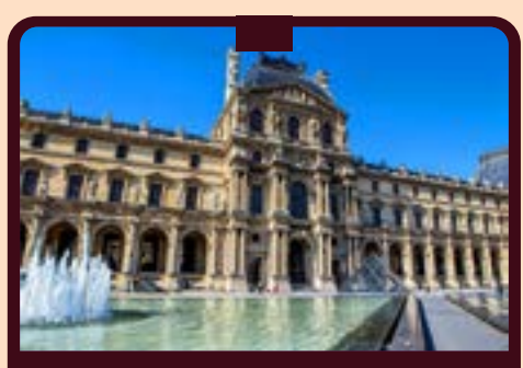
Musée du Louvre