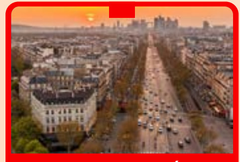
Avenue des Champs Élysées

A right choice of conference destination is an important aspect of any international conference and keeping that in consideration, Euro Ophthalmology 2020 is scheduled in the Beautiful city "Paris".