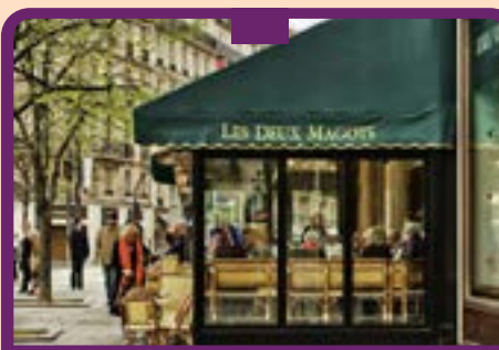
Bustling Boulevards and Legendary Cafés