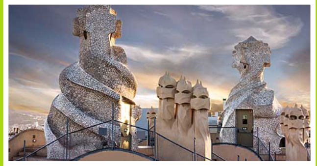
Casa Milà (La Pedrera)