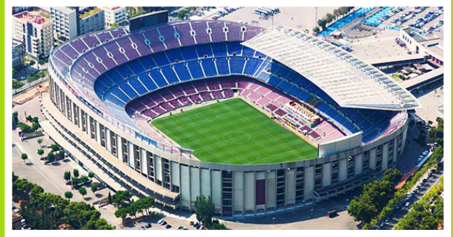
Camp Nou Stadium of FC Barcelona