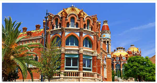
Hospital de Sant Pau