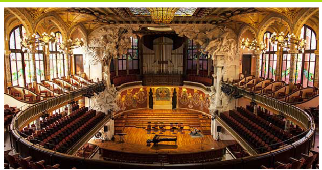
Palau de la Música Catalana