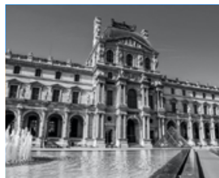
MUSÉE DU LOUVRE