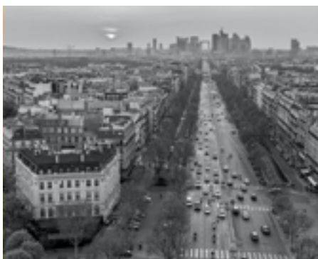
AVENUE DES CHAMPS ÉLYSÉES

A right choice of conference destination is an important aspect of any international conference and keeping that in consideration, Future Pharmaceuticals 2022 is scheduled in the Beautiful city "Paris".