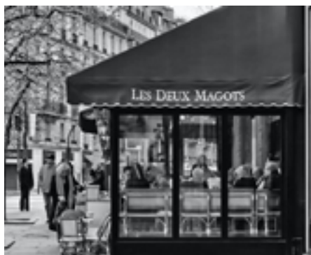
BUSTLING BOULEVARDS AND LEGENDARY CAFÉS