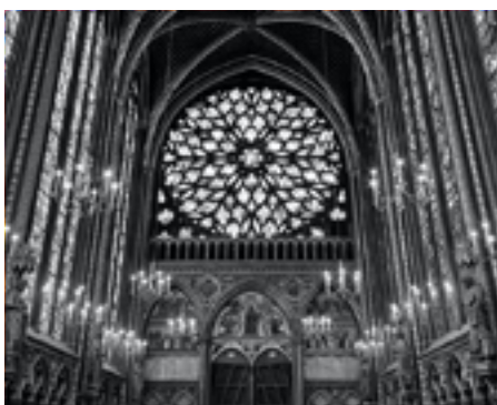
MUSICAL CONCERTS AT SAINTE CHAPELLE