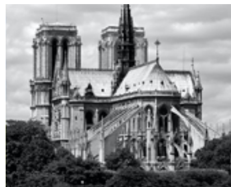
CATHÉDRALE NOTRE DAME DE