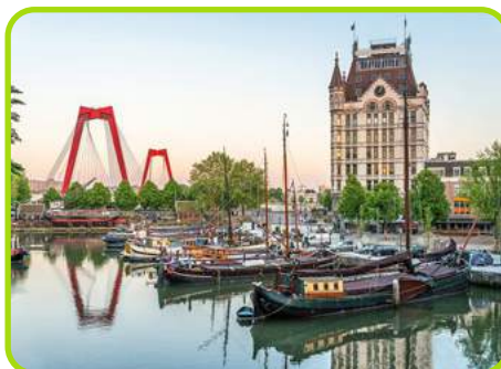
Oude Haven, Rotterdam