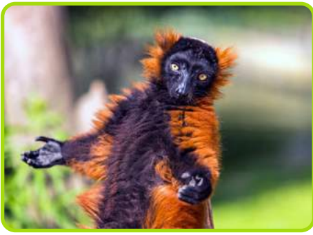
Amsterdam Royal Zoo