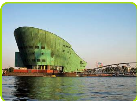
NEMO Science Museum