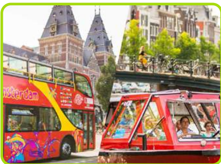
Hop-On Hop-Off Bus and Boat

A right choice of conference destination is an important aspect of any international conference and keeping that in consideration, Future of PMPH 2024 is scheduled in the Beautiful city "Amsterdam".