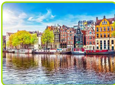
Jordaan and Amsterdam's Canals