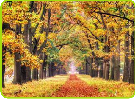
De Hoge Veluwe National Park, Otterlo