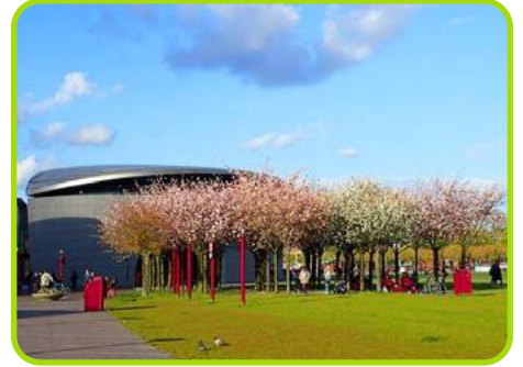
Great Art at the Van Gogh Museum