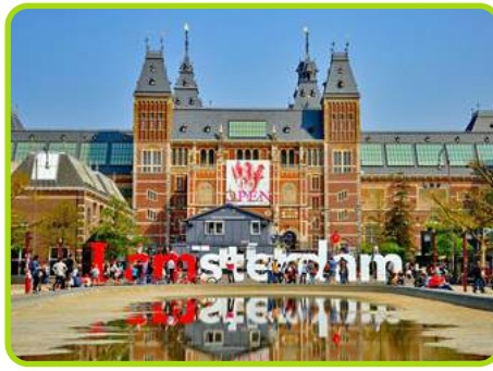
Art Collections at the Rijksmuseum