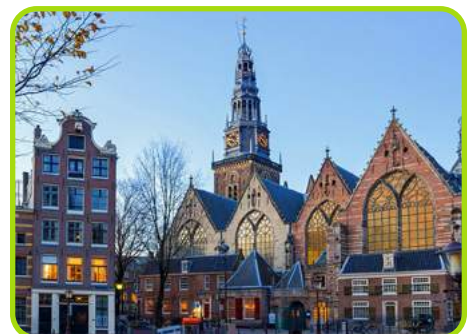
Oude Kerk's Tower