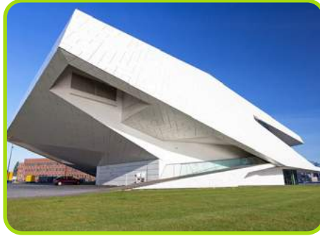
EYE Film Institute Netherlands