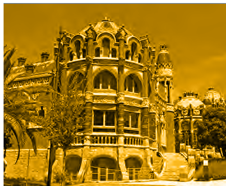
HOSPITAL DE SANT PAU