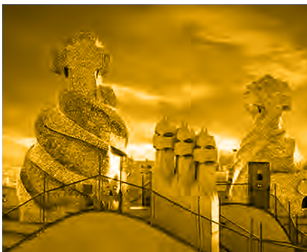
CASA MILÀ (LA PEDRERA)