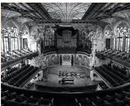
PALAU DE LA MÚSICA CATALANA