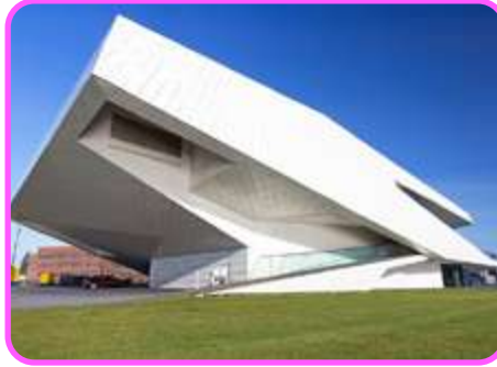
EYE Film Institute Netherlands