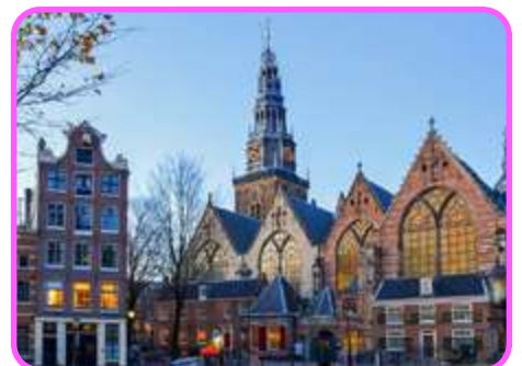
Oude Kerk's Tower