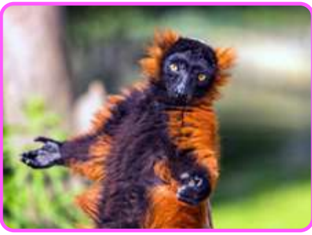
Amsterdam Royal Zoo