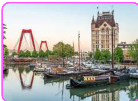
Oude Haven, Rotterdam