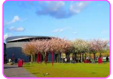
Great Art at the Van Gogh Museum