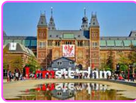
Art Collections at the Rijksmuseum