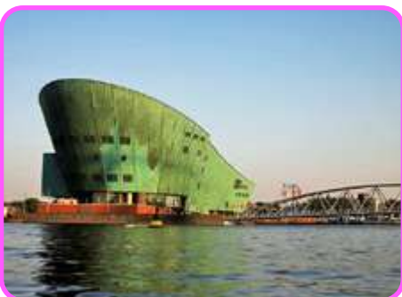
NEMO Science Museum