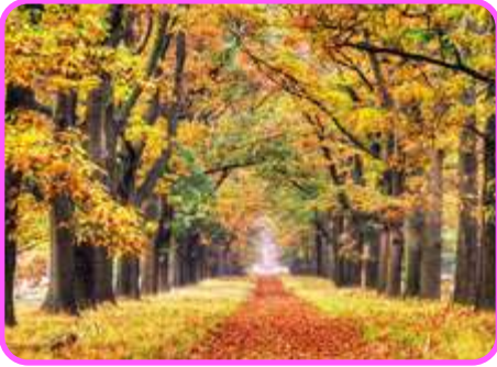
De Hoge Veluwe National Park, Otterlo