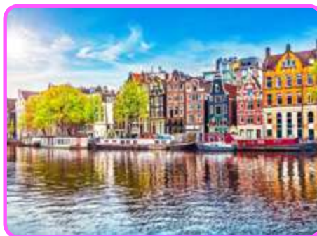
Jordaan and Amsterdam's Canals