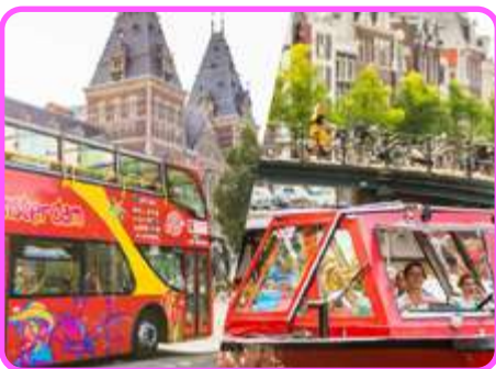
Hop-On Hop-Off Bus and Boat

A right choice of conference destination is an important aspect of any international conference and keeping that in consideration, FitTech 2024 is scheduled in the Beautiful city "Amsterdam".