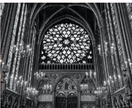
MUSICAL CONCERTS AT SAINTE CHAPELLE