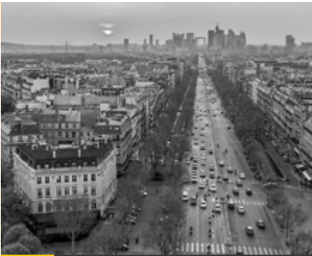
AVENUE DES CHAMPS ÉLYSÉES

A right choice of conference destination is an important aspect of any international conference and keeping that in consideration, Adv. Nutrition 2022 is scheduled in the Beautiful city "Paris".