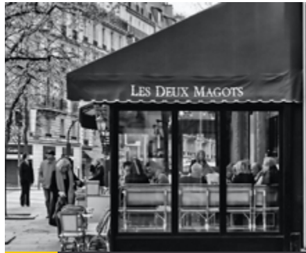
BUSTLING BOULEVARDS AND LEGENDARY CAFÉS