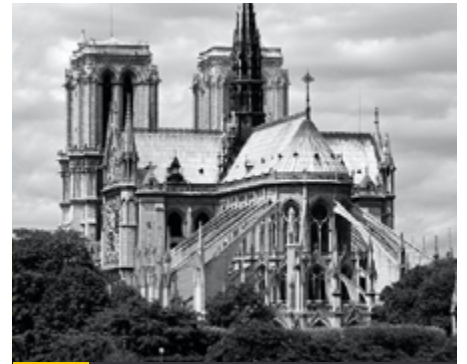
CATHÉDRALE NOTRE DAME DE