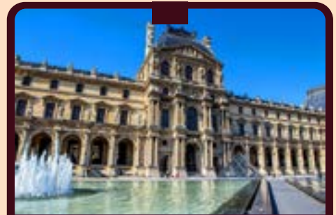
Musée du Louvre