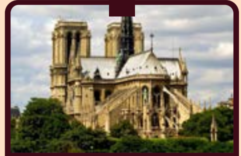
Cathédrale Notre Dame de