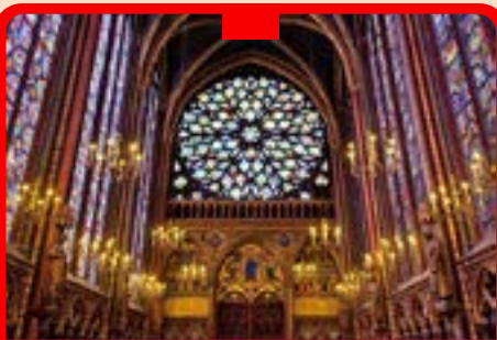
Musical Concerts at Sainte Chapelle