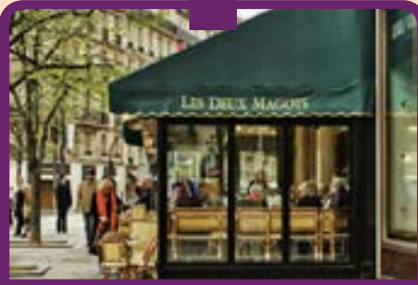
Bustling Boulevards and Legendary Cafés