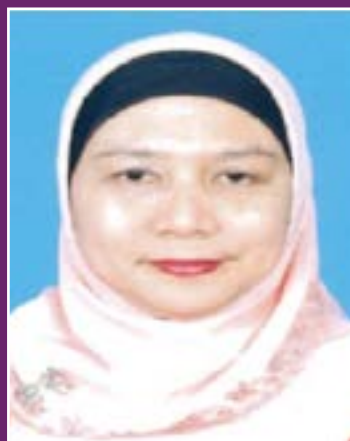
Astuty Bt Amrin UTM Malaysia