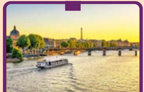
Seine River Cruises