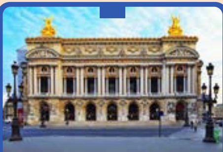
Palais Garnier, Opéra National de Paris