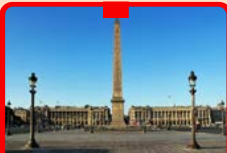
Place de la Concorde