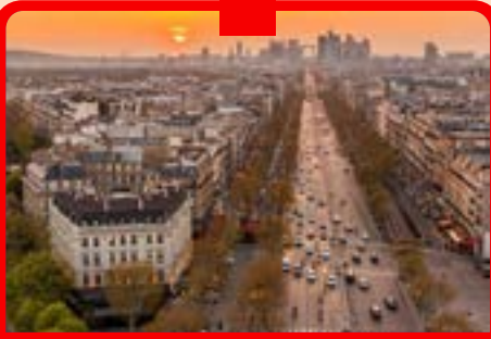
Avenue des Champs Élysées

A right choice of conference destination is an important aspect of any international conference and keeping that in consideration, Euro Materials Science 2020 is scheduled in the Beautiful city "Paris".