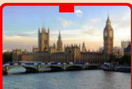
Palace of Westminster