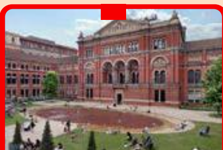
Victoria and Albert Museum