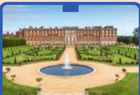
Hampton Court Palace