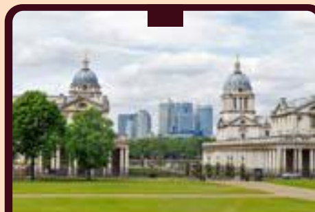
Greenwich and Docklands