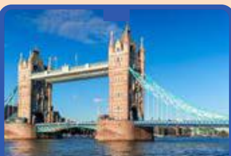
Tower Bridge London