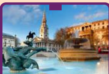
Piccadilly Circus and Trafalgar Square