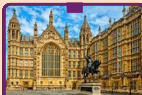
Whitehall and Parliament