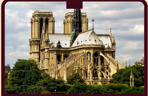
Cathédrale Notre Dame de