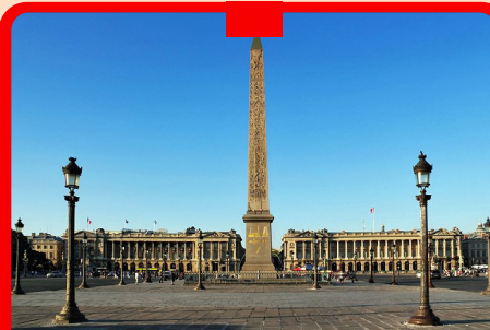
Place de la Concorde