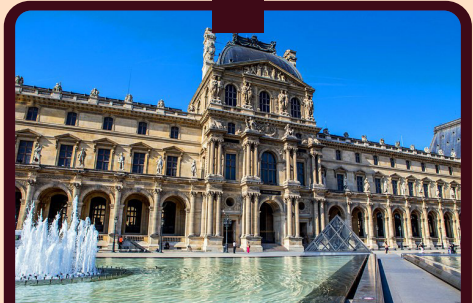
Musée du Louvre