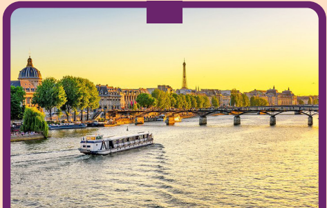
Seine River Cruises