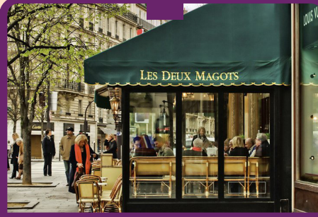
Bustling Boulevards and Legendary Cafés