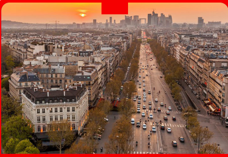
Avenue des Champs Élysées

A right choice of conference destination is an important aspect of any international conference and keeping that in consideration, Euro Cardiology 2021 is scheduled in the Beautiful city "Paris".