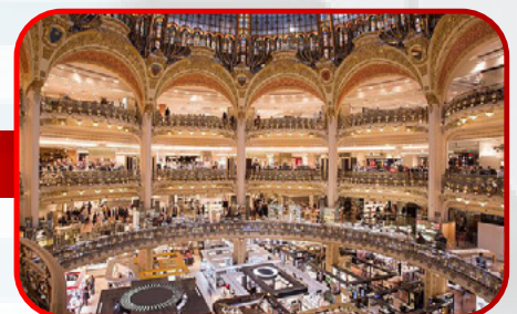
Galeries Lafayette Paris Haussmann