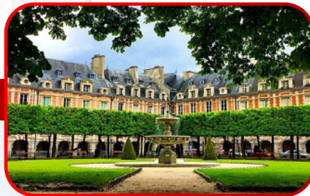
Place des Vosges