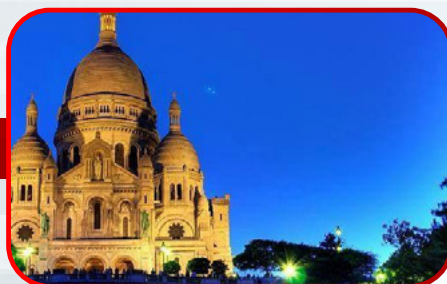
Basilique Du Sacre-Coeur De Montmartre