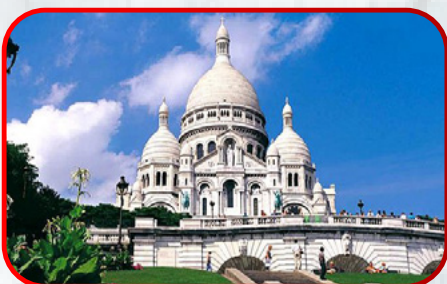
The Paris Catacombs