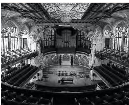
PALAU DE LA MÚSICA CATALANA