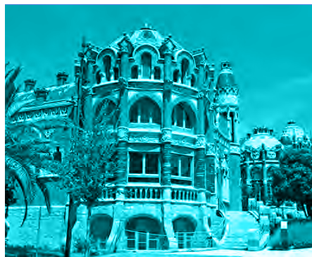
HOSPITAL DE SANT PAU