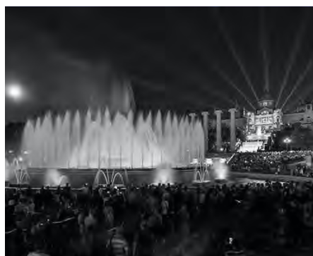
PARC DE MONTJUÏC & MAGIC FOUNTAIN