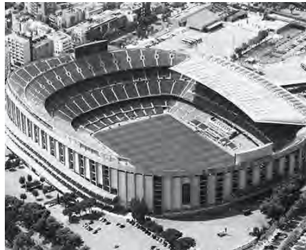
CAMP NOU STADIUM OF FC BARCELONA