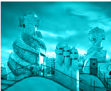
CASA MILÀ (LA PEDRERA)