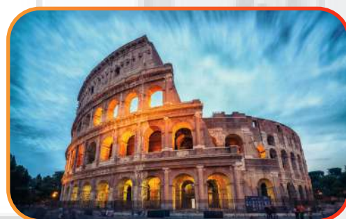
The Roman Colosseum