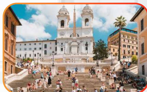
The Spanish Steps