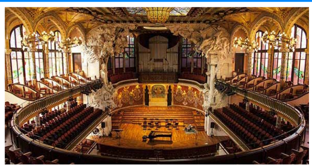
Palau de la Música Catalana