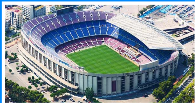
Camp Nou Stadium of FC Barcelona