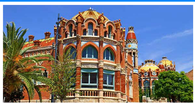
Hospital de Sant Pau