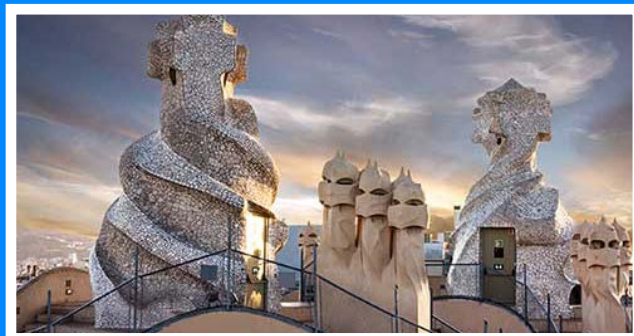
Casa Milà (La Pedrera)