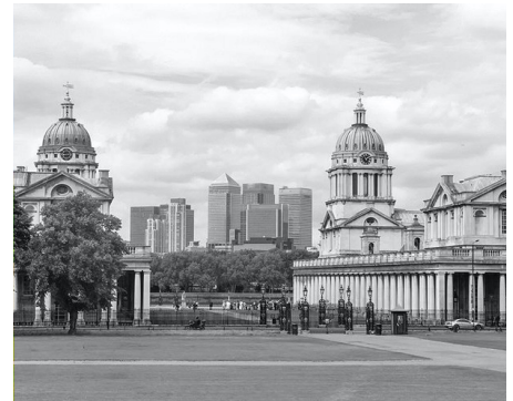
GREENWICH AND DOCKLANDS