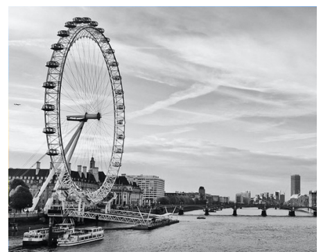
THE LONDON EYE