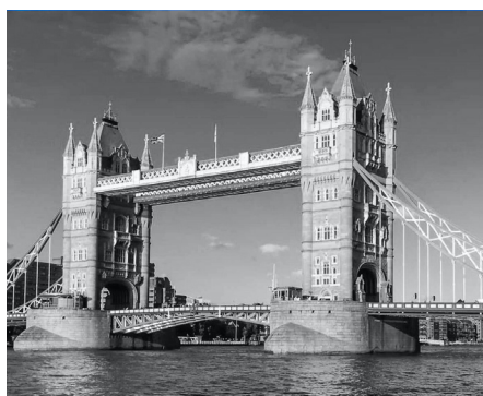
TOWER BRIDGE LONDON