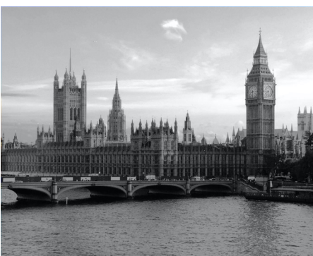
PALACE OF WESTMINSTER