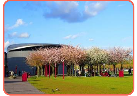
Great Art at the Van Gogh Museum