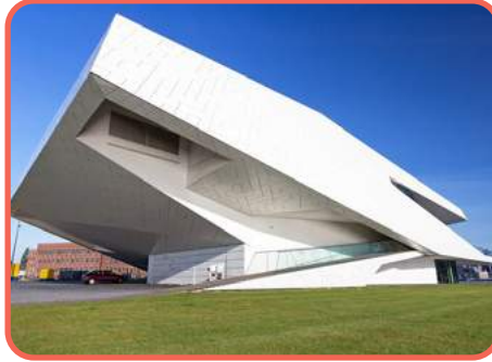
EYE Film Institute Netherlands