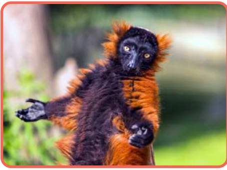
Amsterdam Royal Zoo