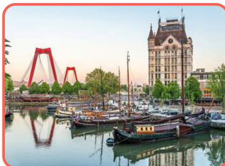
Oude Haven, Rotterdam