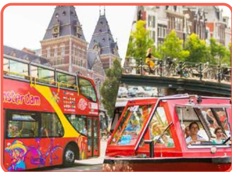
Hop-On Hop-Off Bus and Boat

A right choice of conference destination is an important aspect of any international conference and keeping that in consideration, Adv. AMMH 2024 is scheduled in the Beautiful city "Amsterdam".