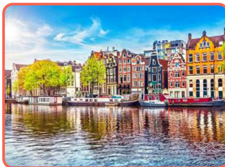
Jordaan and Amsterdam's Canals