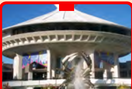
Museum of Vancouver